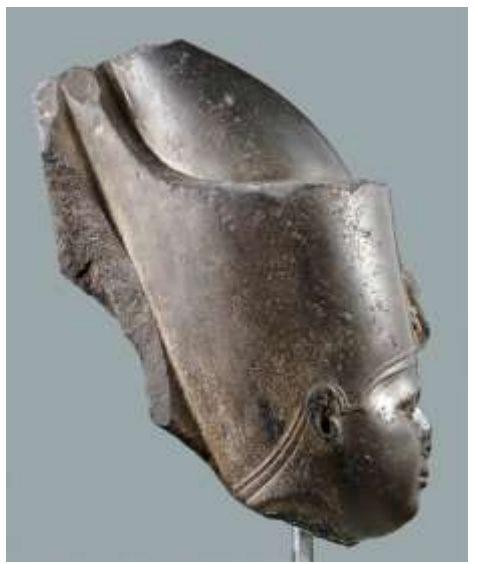
Fig.5. Portrait of Ptolemy VIII (front and profile), Egyptian, Ptolemaic, mid-2<sup>nd</sup> century B.C. Black diorite, h. 18½ in. (47 cm) (preserved). Musées Royaux d'Art et d'Histoire, Brussel.