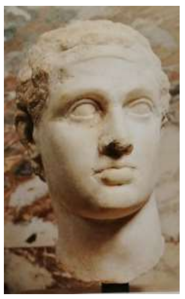
Fig.3 . Portrait of Ptolemy XII in Louvre Museum no. 3449:WALKER, Cleopatra of Egypt , Cat.21,22.