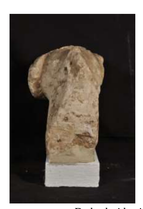
D- back side view.