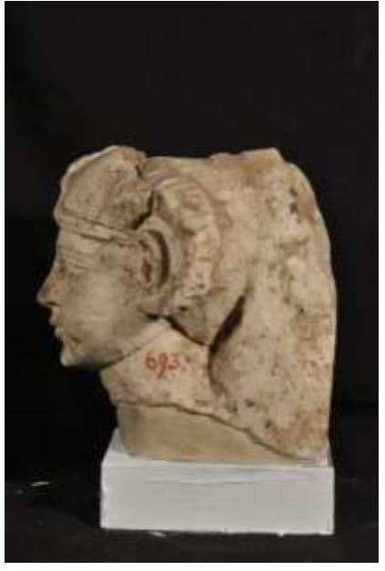
C- left side view.