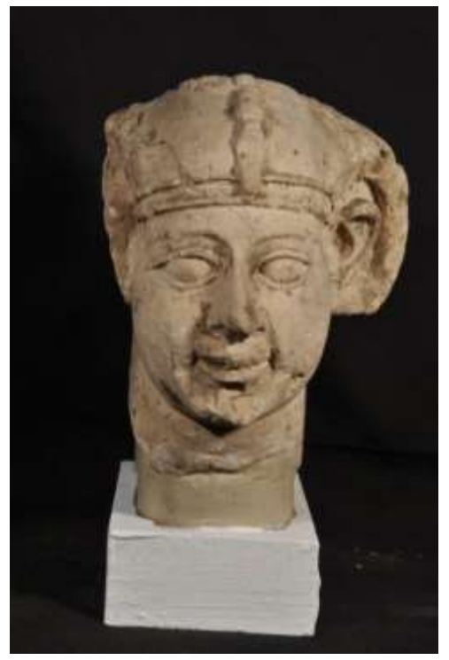
a- frontal view.