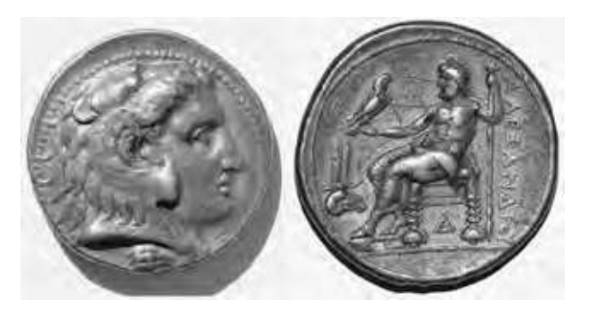
FIG. 6.2. Posthumous issue of Alexander III (minted under Ptolemy I). AR Tetradrachm (17.20g). Mint of Memphis? (c.322–317bc). Nicholson Museum (Hosking Collection), University of Sydney.