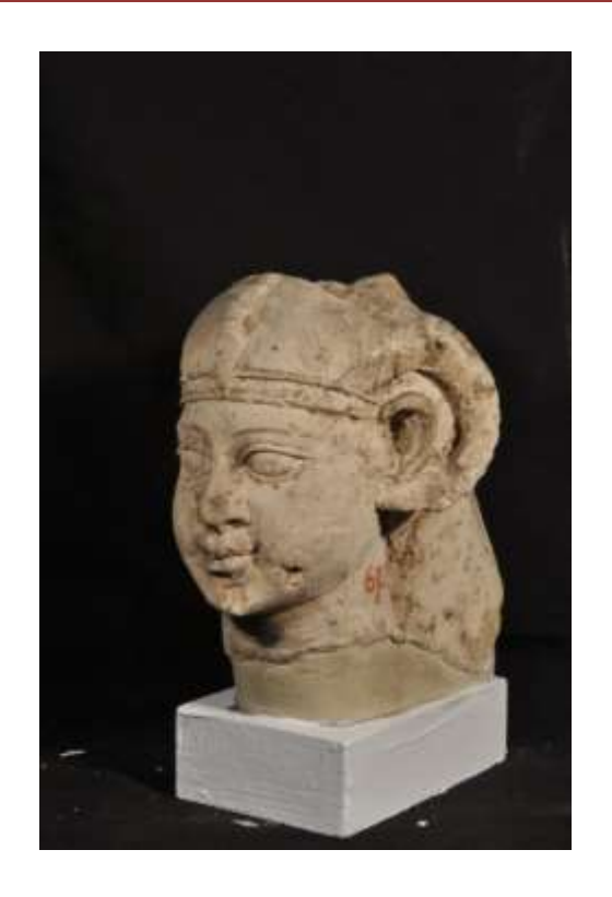
B- left side view.