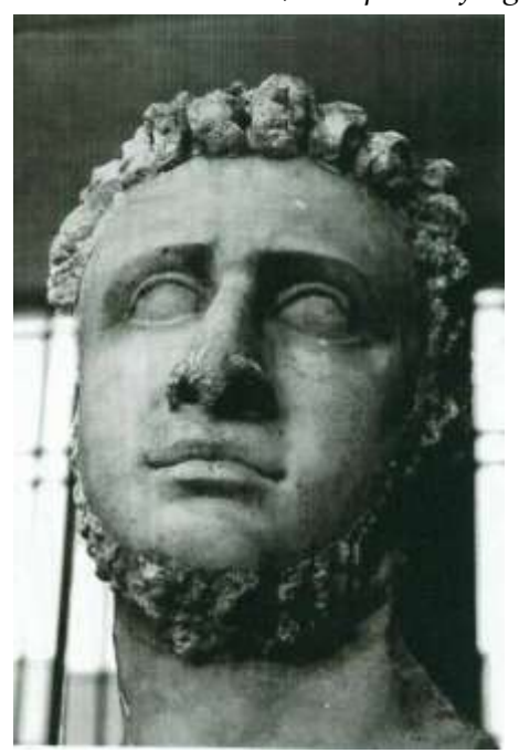
FIG.4 . Portrait of Ptolemy IX in Boston, Museum of Fine Arts 59.51:ASHTON, Ptolemaic Royal Sculpture , Cat. 21.